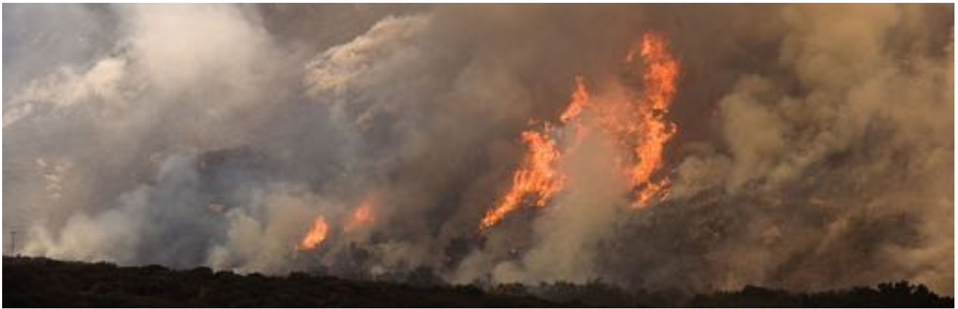
This photo is of a wildfire in Wyoming where incident command meteorologists use GSL-developed weather models to direct fire-fighting operations.

Objective 2.2. Advance research of physical and atmospheric composition processes in Earth-system models that affect such things as air quality, human health, and weather systems.