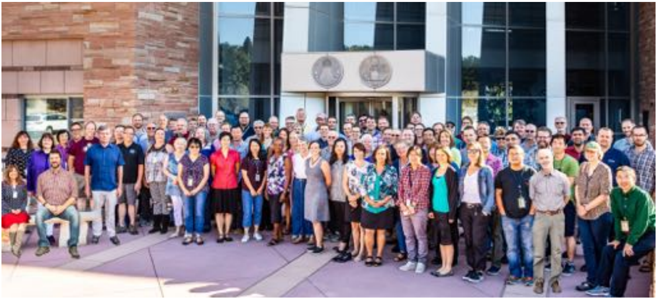
GSL staff in front of the David Skaggs Research Center in Boulder, Colorado.