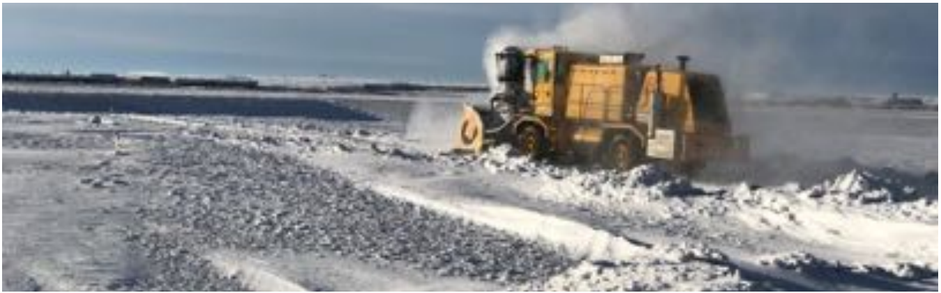
GSL evaluated the performance of winter weather forecast ensembles for snow at Denver International Airport and similar Mountain West airports.

Objective 3.4. Ensure that investments improve the skill, efficiency, and delivery of products, tools, and applications to operations