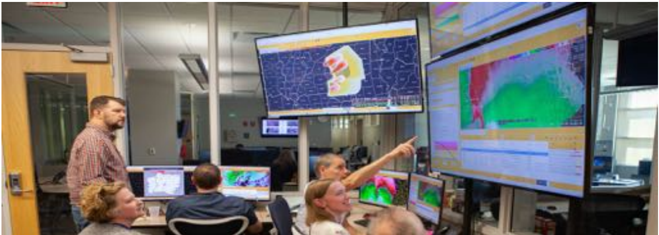
GSL researchers work with NWS forecasters to test new technologies that will help streamline the forecast process and get the right information to decision-makers.