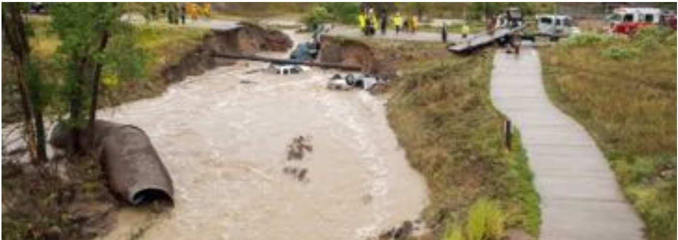
GSL is working to improve forecasts of how much precipitation will fall during a rain event. This photo was taken during the catastrophic 2013 floods in Colorado.