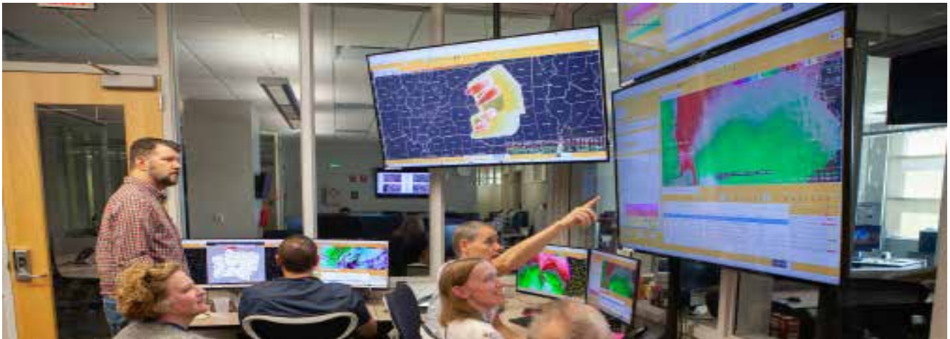
GSL researchers work with NWS forecasters to test new technologies that will help streamline the forecast process and get the right information to decision-makers.