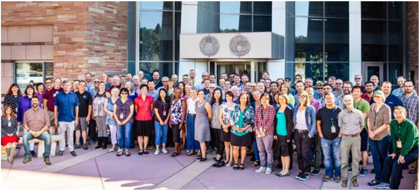
GSL staff in front of the David Skaggs Research Center in Boulder, Colorado.