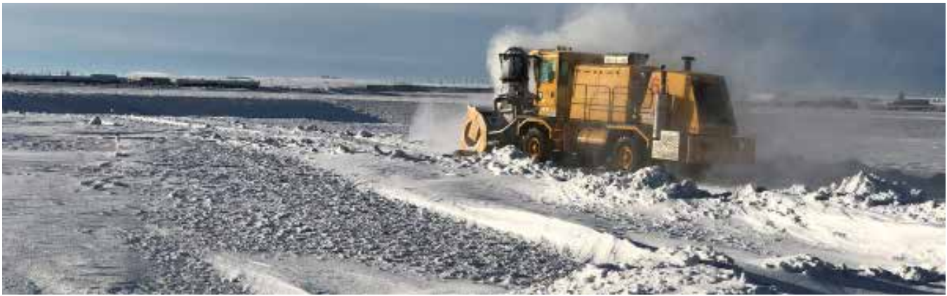
GSL evaluated the performance of winter weather forecast ensembles for snow at Denver International Airport and similar Mountain West airports.

Objective 3.4. Ensure that investments improve the skill, efficiency, and delivery of products, tools, and applications to operations