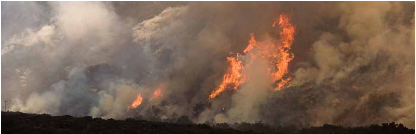
This photo is of a wildfire in Wyoming where incident command meteorologists use GSL-developed weather models to direct fire-fighting operations.

Objective 2.2. Advance research of physical and atmospheric composition processes in Earth-system models that affect such things as air quality, human health, and weather systems.