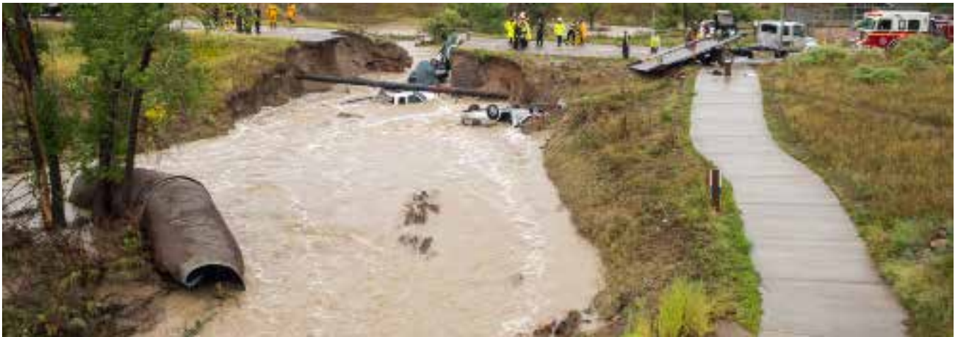
GSL is working to improve forecasts of how much precipitation will fall during a rain event. This photo was taken during the catastrophic 2013 floods in Colorado.